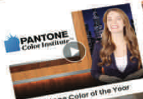
Pantone Color of the Year