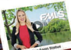
Coming Soon Status